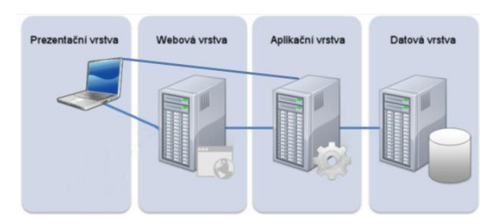
Fig. 1: Basic structure of the information system

Windows Server. The site uses ASP.NET version 2.0. The application is built on the Microsoft.NET version 2.0 application interface. The structure of the information system is displayed on Fig. 1.