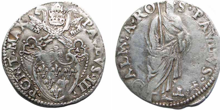
Fig. 3-4: Pope Paul III (1534–1549), mint Roma, silver giulio

If we attempt to create a more detailed content analysis of this document, then it is possible to completely separate the revenues and expenditures. The revenue component is (in addition to cash reserves) for the most part made up of standard instruments that have only been formally reported as a source of funding: i.e. loans that have been guaranteed by papal income or taxes levied for a special purpose. For the papal accounting of that time, it did not matter what sources the money came from, only the sum was important. On the contrary, the expenditure component covers mainly the needs, actually or at least formally related to the military campaign to Germany in autumn 1546. However, that was not always the case.