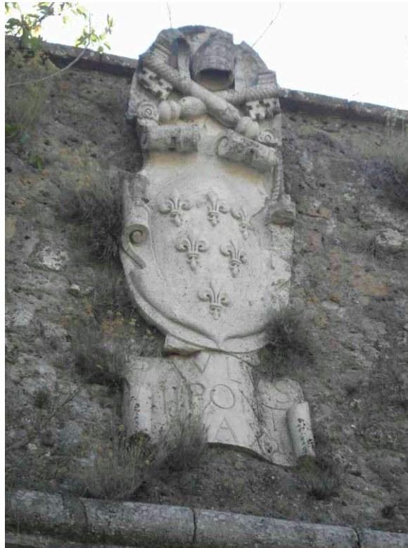
Fig. 6: Coat of Arms of the Pope Paul III; main gateway of the Nepi Fortress

documentation available to L. Pastor that there were problems with the payment of salary from the very beginning of the operation of the Papal army in Germany. 72 That is probably why the Papal army behaved on the German territory the way they were used to behave in the Northern Italian wars: That is like villains, looting rural houses and robbing anyone who cannot resist, no matter whether it is a subdued enemy or an ally. Moreover, it was hardly possible to distinguish it in the complex territory of southern Germany, especially since the Papal soldiers, in their vast majority, did not speak German.