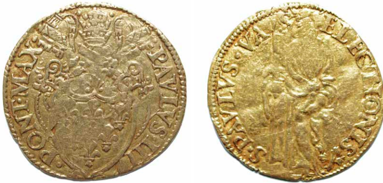
Fig. 1-2: Pope Paul III (1534–1549), mint Roma, gold scudo

Only exceptionally, other coins of the Papal monetary system appear in the accounts: i.e. golden ducats with a higher weight (cca. 3.5 g of pure gold) and thereby also a higher payment power than scudi oro di oro ; and then also small coins referred to as baiocchi . These coins, the name of which gave rise to an entirely new monetary unit, thereby accelerated the gradual transition to a simpler decimal accounting system (1 scudo = 100 baiocchi; 1 teston = 30 baiocchi, 1 giulio = 10 baiocchi; 1 baiocco = 5 quattrini) that was used in the papal accounting in the middle of the 16th century. However, Allioti's accounting documentation is kept in an old monetary accounting system (1 scudo = 20 soldi, 1 soldo = 12 denari).