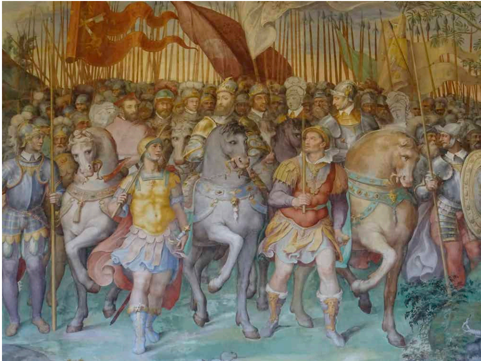
Fig. 9: Imperial and Papal allied forces at the beginning of the Schmalcaldic war; Caprarola Castle, Italy

this campaign: Papirio Capozucca, Marcel di Negro, Bartolomeo Boreto from Mirandola and Sforza da Tore (who is apparently the same person as Sforza of Orvieto, commander of the lightweight squadron). 148