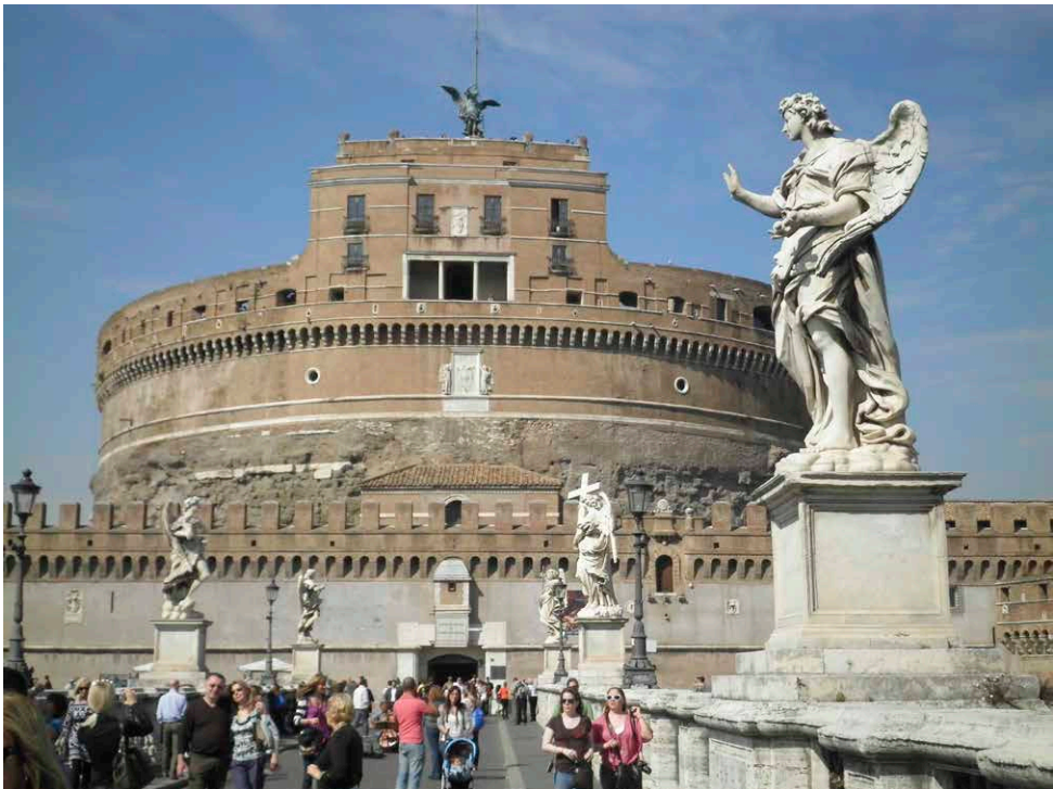
Fig. 5: Roma, the Angelic Castle, main papal treasury during the 16 th century