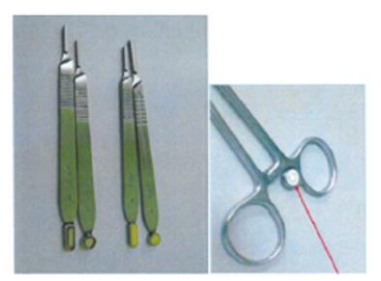
Fig. 3 Putting RFID chip into the separate case that is attached to the tool [18]

Create a separate case with a tag that is attached to the tool, as shown in Figure 3. This solution appears to be the best for new tools. In the case of pean, it is a ceramic tag with a frequency of 13.56 MHz (high frequency), a thickness of 2 mm and a diameter of 6 mm. This system is theoretically already ready for practice. The problem with this tag storage is that it would have to buy completely new instrumentation, which is clearly financially unbearable. The second problem is the reading frequency of the used tag, because UHF (ultra high frequency) tag cannot be used here because of its interference. This tag, due to its location in a metal tool and shielding the human body when inserted to a patient, would not read the RFID antenna in the door frames. The same problem also occurs with absorbent material, whose subchapter provides a technical solution to this problem. [13]