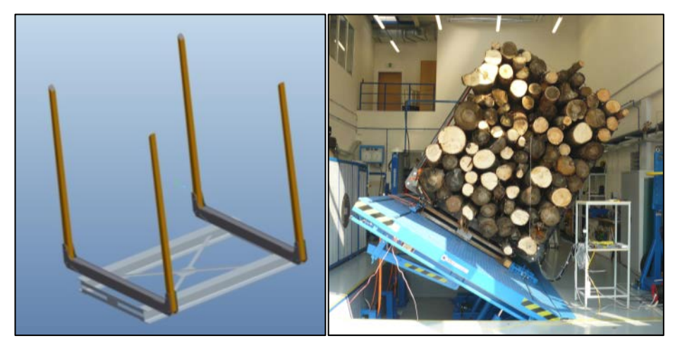
Fig. 1: CAD model of empty specimen and tilted specimen on the tilting platform (Pokorný et al., 2014)

For experiment was prepared specimen consisted of two whole bunks and auxiliary frame as a holder of bunks. Auxiliary frame was also used for fixation the specimen to the tilting platform. Measuring part was one of four stanchions. It was equipped by ten force sensors and five strain gauges along active length of the stanchion. These were protected by safety shields hung on stanchion and enabling force transmission from logs to the stanchion. The specimen was loaded with logs of total mass of 9 tons and length of 4 meters.