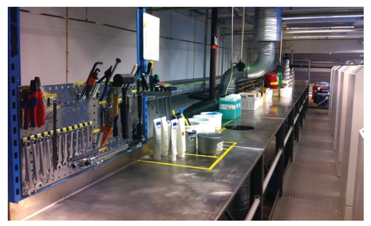
Figure 1: Surroundings of the KBA Rapida 142 sheet-fed offset press

and removed. After this process of selection, it was re-considered whether such materials and devices had been retained in the work area that were integral parts of daily work, and if their quantities had indeed been effectively cut back. For the required tools, expedient storage places were accurately defined and created, while other objects were stored in an easily recognizable arrangement. As a fundamental rule, objects, base materials that were necessary for adjustment or production were placed so that they should become accessible in the quickest and shortest way. Figure 1 demonstrates the working environment of the KBA Rapida 142 sheet-fed offset printing press. Following the completion of the 5S process, only the necessary tools remained in the work area, in ergonomic, visually recognizable arrangement.