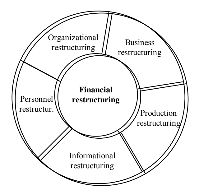
Picture 2: Basic types of company restructuring from the point of view of the company activities

However, the above concept is greatly limited. We can deduce that the process of company restructuring in the complex interpretation includes financial restructuring (focused both on the financial, property areas and on the ownership structures of the company), production restructuring (which involves both the produced goods and the provided services, and the used production equipment or technology, and also the organization of the production process), business restructuring (directed at the area of inputs and mainly at the area of outputs from the organization), organizational restructuring (focused on the organizational structure of the company defining the functional roles and relationships within the company processes), informational restructuring (i.e. solution to the problem of information systems of the organization in the complex concept) and personnel restructuring (where the attention is paid to human resources - quantity, structure, quality), see Picture 2.